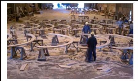
Skilled Structural Wood Systems craftsmen fabricating the members to the projects exact requirements.